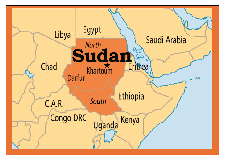
The Fall of Sudan to Evil Nations

It is time for the saints of God to wake up to the reality that our days on this earth are numbered. Be ready for the shout that will take us out!